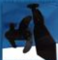
Integrated Minn Kota® electric motor for effortless cruising (battery not included)