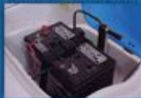
Battery compartment (battery not included)