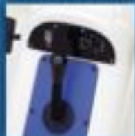
Choose the option of exercise through pedal power or the ease of motorization with the flick of a switch